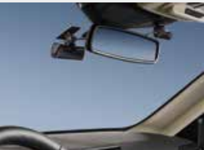
Dash cam systems 1