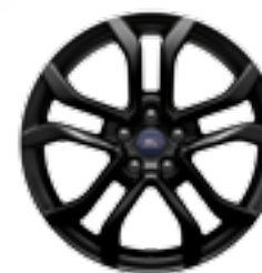
18" EBONY BLACK-PAINTED ALUMINUM Ⓢ Included with SE Appearance Package

CLOTH SEATING SURFACES: Medium Light Stone, Ebony, Light Putty/Bold Brown Vinyl