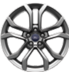
18" PREMIUM PAINTED ALUMINUM Ⓞ Standard

ACTIVEX SEATING SURFACES: Medium Light Stone, Ebony