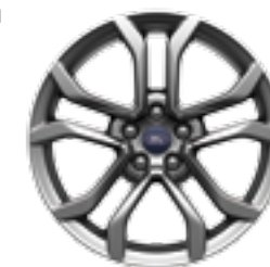
18" PREMIUM PAINTED ALUMINUM ⚙️ Standard

LEATHER-TRIMMED SEATING SURFACES: Russet, Ebony