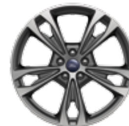
19" MACHINED-FACE ALUMINUM WITH MAGNETIC-PAINTED POCKETS Ⓢ Standard