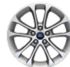
17" SPARKLE SILVER-PAINTED ALUMINUM Ⓢ Standard