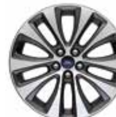
18" MACHINED-FACE ALUMINUM WITH MAGNETIC-PAINTED POCKETS Ⓢ Included with All-Wheel Drive Package