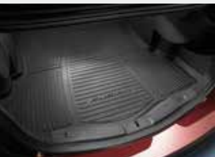
Cargo area protector

New Vehicle Limited Warranty. We want your Ford Fusion ownership experience to be the best it can be. Under this warranty, your new vehicle comes with 3-year/36,000-mile bumper-to-bumper coverage, 5-year/60,000-mile Powertrain Warranty coverage, 5-year/60,000-mile safety restraint coverage, and 5-year/unlimited-mile corrosion perforation (aluminum panels do not require perforation) coverage – all with no deductible. Fusion unique electric components are covered during the Hybrid/Electric Unique Component Coverage, which lasts for 8 years or 100,000 miles, whichever occurs first. Please ask your Ford Dealer for a copy of these limited warranties.