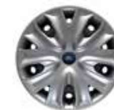
16" STEEL WITH SILVER-PAINTED COVERS Ⓞ Standard