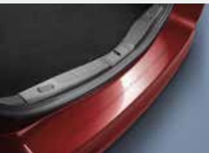
Rear bumper protector